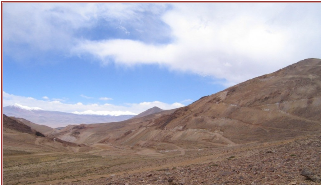
Figure 2. Arqueros Sur looking east