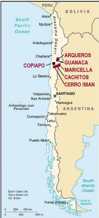
Location of Laguna Resources' projects in Northern Chile

Lomas Bayas – El Durazno caldera, which is emplaced within the Carrizalillo mega caldera (Paleocene – Early Eocene).