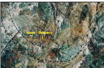
Iman and Romero prospects (Cerro Iman Gold Project) occur within the ring structure of the Lomas Bayas Caldera

Gold mineralisation occurs disseminated within a hydrothermal breccia which has a continuous outcrop extent of 60 x 300 metres. The observed breccia comprises poorly sorted fragments of volcanic rock in a gritty matrix. Alteration is argillic silicic with sericite and tourmaline. The outcrop is gossanous, with relict pyrite and minor chalcopyrite. There is evidence of a cap to the breccia pipe, indicating that Iman is high in the system, with its greatest potential lying below. There are also artisanal workings based on gold veins on the concessions and in close proximity to the hydrothermal pipe at Iman.