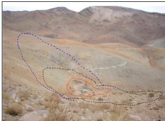
The principal mine at Cerro Iman occurs within an alteration halo, with the dimensions of the pipe (central, outcropping zone outlined by inner circle) at 450 metres wide (for scale). The outer black and blue haloes represent the possible sub-surface extent of the hydrothermal pipe.

Mina Iman is an artisanal working, which has been channel sampled, with a section grade of 54 metres at 1.2 g/t gold including 6 metres at 3.4 g/t gold, with individual values of up to 14 g/t gold.